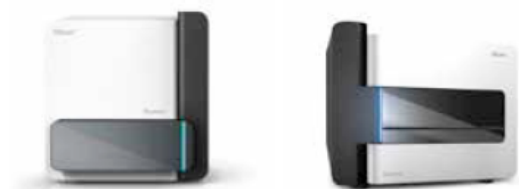
Table 1: HiScan and iScan at a glance

With a high signal-to-noise ratio, high sensitivity, low limit of detection, and broad dynamic range, both scanners produce exceptional data quality for use in any biomarker screening or validation study. The high call rates (> 99% achieved with the Infinum Assay) enable powerful genome-wide association studies and high-resolution CNV analysis, accurately detecting even single copy number changes. In addition, these systems can be used for fast, accurate screening in agrigenomics and for validating complex disease studies. Methylation and gene expression profiling also benefit from the sensitive measurement and wide dynamic range.